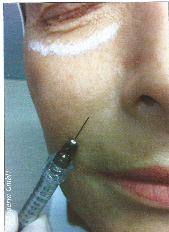
Needle injection technique